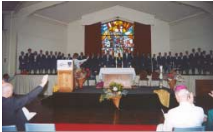
The Catherine McAuley School Community blessing the New Leaders